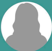
Local Pediatric Dentist