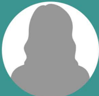
Local Pediatric Dentist