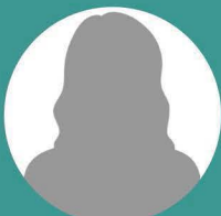
Local Pediatric Dentist